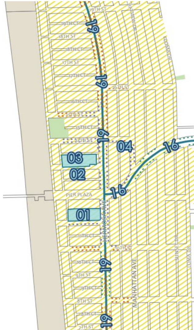
Center w/ Lots A, B, and C