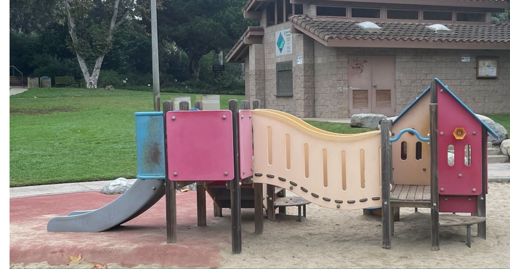
Ages 2 - 5 Remove & replace with new structure + rubberized mat + shade sail