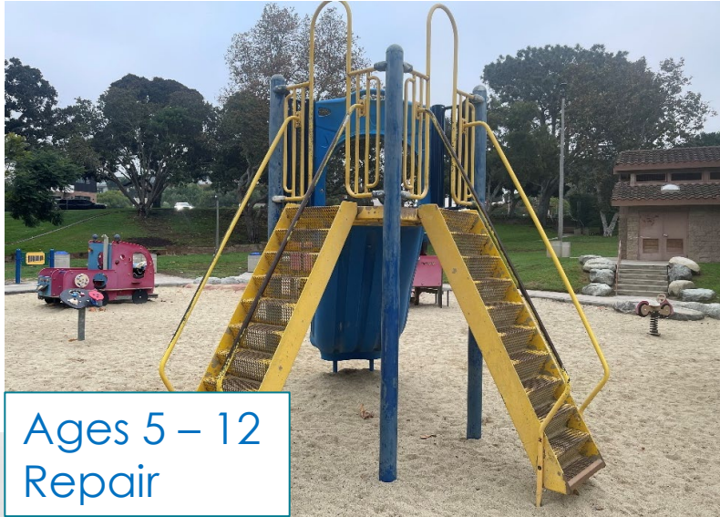
Ages 5 – 12 Repair