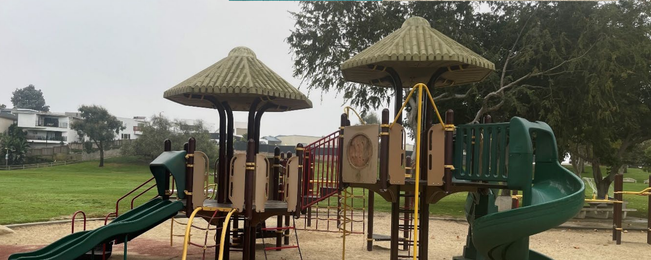
Ages 5 – 12 Repair + shade sail + rubberized mat