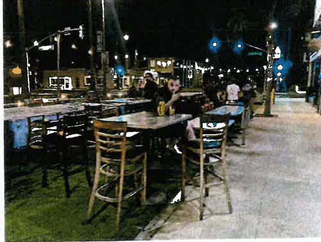
Five (5) pictures of patrons with pint glasses filled with an amber fluid resembling beer on the outside parklet for Pedones Pizza, all taken by Supervising Agent Delarosa, at approximately 0227 hours on August 20, 2023.