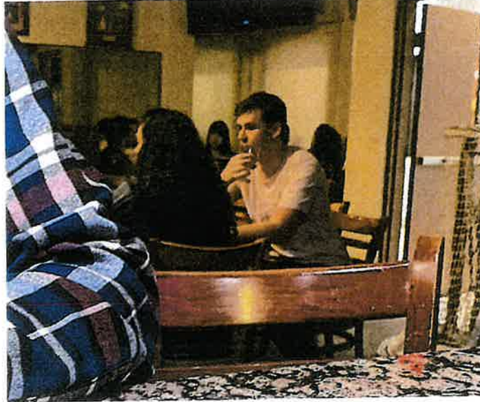
A picture of patrons inside the premises, taken by Agent M. Connolly at approximately 0217 hours on August 20, 2023.