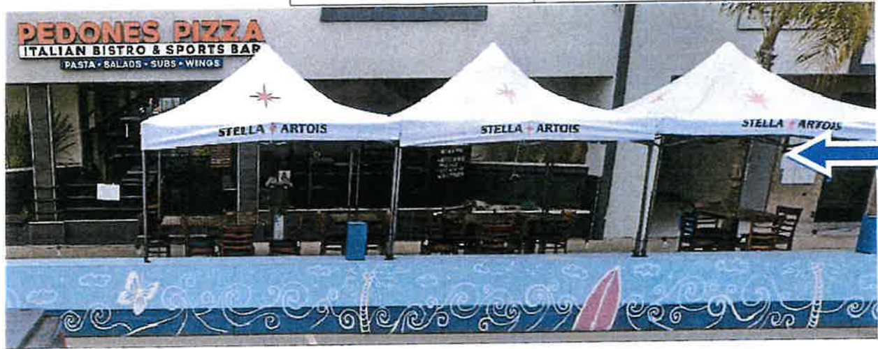
A Google map snip of the front of Pedones Pizza facing Hermosa Avenue and parklet, including an blue arrow pointing at the walkway located on the south side of the premises (February 2021).

Officer DeAndrade and I moved over to the walkway located on the south end of the portion premises. There is a door located on the south end of the premises that leads into this walkway. This door was propped open, and I could see inside the premises, including the fixed bar area (see picture below and attachments #1 and #2 for more information).