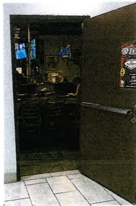
A picture of the propped open door located on the south side with a view of the interior of the premises, taken by Agent M. Connolly at approximately 0204 hours on August 20, 2023.

Officer DeAndrade and I moved over to the walkway located on the south end of the portion premises. There is a door located on the south end of the premises that leads into this walkway. This door was propped open, and I could see inside the premises, including the fixed bar area (see picture below and attachments #1 and #2 for more information).