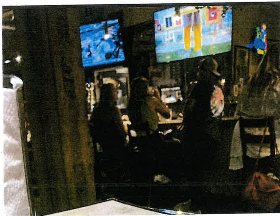
A picture of patrons at the fixed bar including, a female patron drinking an amber fluid from a clear pint glass, taken by Agent M. Connolly at approximately 0217 hours on August 20, 2023.