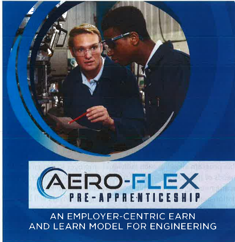
Aero-Flex Pre-Apprenticeship Brochure