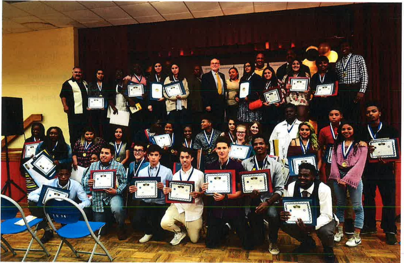
Graduating Cadets from the 2017 Fit for Gold Tutoring & Fitness Academy posed for their class picture along with dignitaries and elected officials from Inglewood, Gardena and Torrance, May 17 th at Rogers Park in Inglewood.