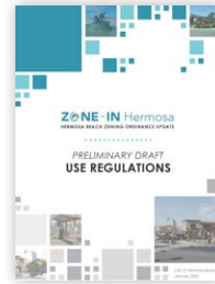
Use Regulations, January 2022

Updated regulations will be drafted in groups of related topics. Each group of updated regulations will be available for public review through the website and study sessions with the Planning Commission.